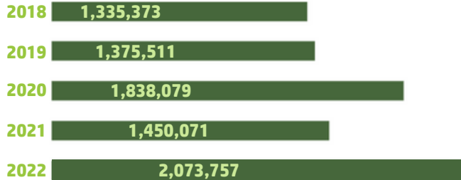
Total Network Visits

We plan to start construction on the building in Spring 2023 so we can begin using the space by year end! Our public phase will start later this year, thank you to everyone who has already supported the campaign.